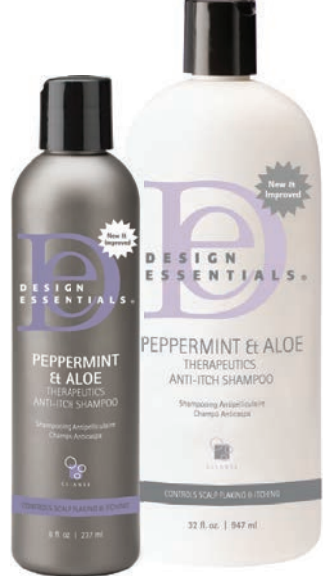
8 oz. | 32 oz.