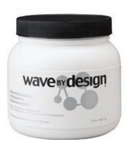
PROFESSIONAL STRENGTH CRÈME REARRANGER