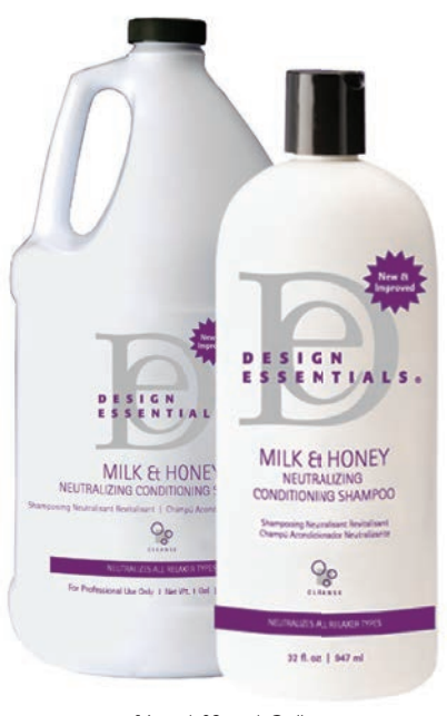
16 oz. | 32 oz. | Gallon

Note: *Continue to shampoo the hair until the lather is white which indicates total cleansing. Ensuring that all relaxer has been removed from the hair will prevent over-processing the hair.