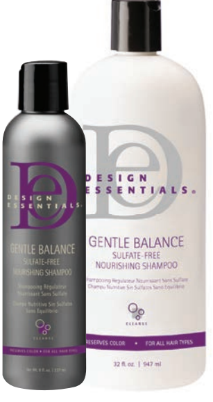
8 oz. | 32 oz.