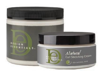
7.5 oz. | 16 oz.

Hair Condition: NORMAL DRY/BRITTLE COLOR TREATED