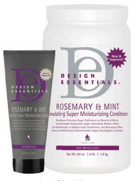
6 oz. | 2 lbs. | 4 lbs.