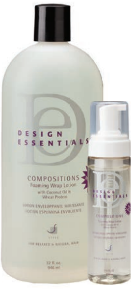
7.5 oz. | 32 oz.