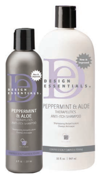
8 oz. | 32 oz.