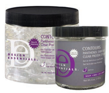
6 oz. | 16 oz.

Hair Condition: OILY NORMAL DRY/BRITTLE COLOR TREATED