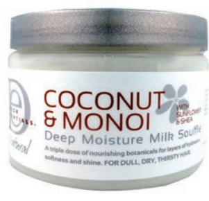
4 oz. | 118 ml.

Hair Type:WAVYCURLYCOILYHair Texture:FINEMEDIUMTHICK/COARSEHair Condition:NORMALDRY/BRITTLECOLOR TREATED