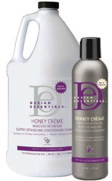
8 oz. | 32 oz. | Gallon