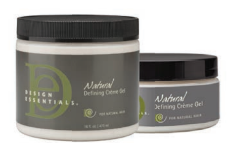
7.5 oz. | 16 oz.

Hair Condition: NORMAL DRY/BRITTLE COLOR TREATED