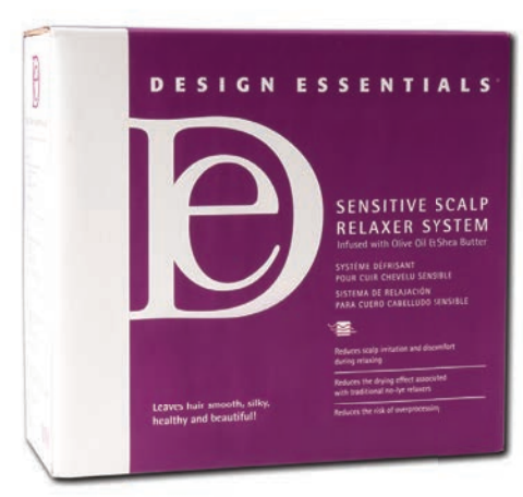
8 app. 1 20 app.