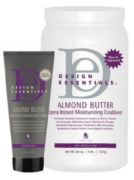
6 oz. | 2 lbs. | 4 lbs.