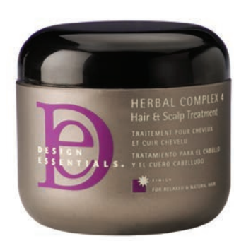
4 oz. 1 16 oz.

Hair Condition: NORMAL DRY/BRITTLE COLOR TREATED