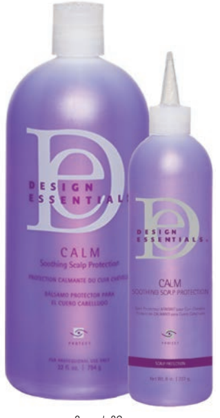
8 oz. 1 32 oz.

Note: Applicator tip pre-cut and measured.