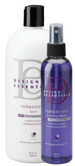
8 oz. | 32 oz.

Spray at the roots, and tease with comb/fingers to lift and create lasting volume