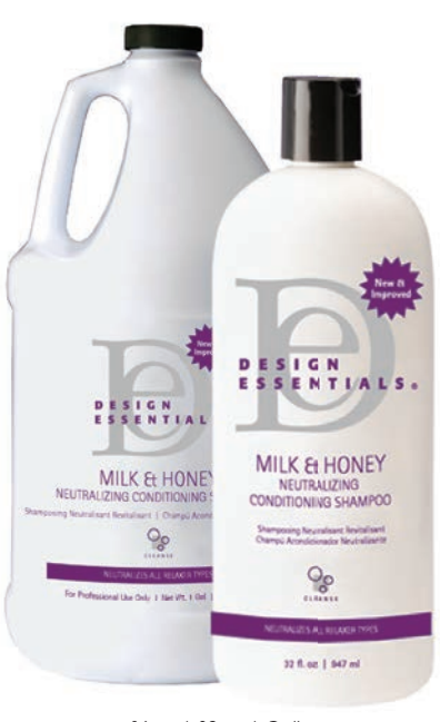
16 oz. | 32 oz. | Gallon

Note: *Continue to shampoo the hair until the lather is white which indicates total cleansing. Ensuring that all relaxer has been removed from the hair will prevent over-processing the hair.