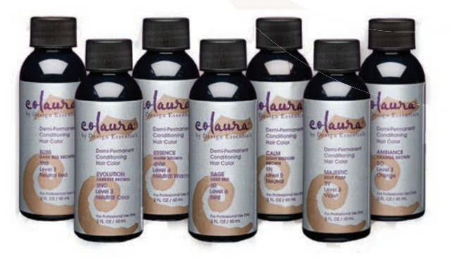
DEMI- PERMANENT CONDITIONING HAIR COLOR