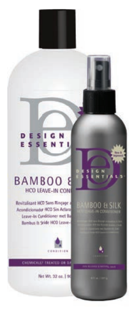
8 oz. | 32 oz.