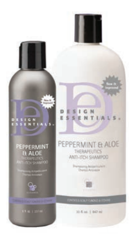
PEPPERMINT & ALOE THERAPEUTICS ANTI- ITCH SHAMPOO