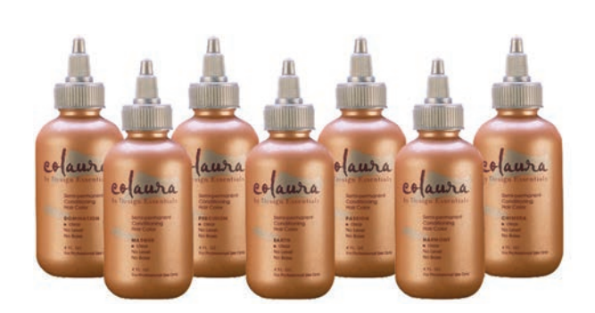
SEMI PERMANENT CONDITIONING HAIR COLOR